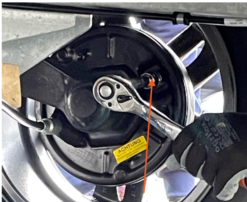
Adjustmentbolt – wrench size SW17